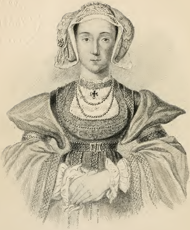
Anne of Cleves.